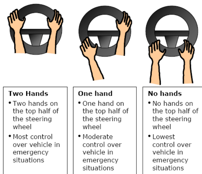
Figure1. An illustration of the ordinal scale of hand positions (Walton & Thomas 2005).

On any given road, normally around 50% of people drive with only one hand on the top section of a steering wheel, less than 25% are observed to drive with two hands in the recommended '10 and 2' position (see figure 1). Variation in the pattern of hand positions observed across a large sample (typically N >2500 observations) reveals that configurations alter with increased objective risk, as inferred from the context (different speed zones, and multi-lane environments) and is acknowledged in self-reports (Thomas and Walton, 2007). Repeated observations of the same drivers indicate the pattern of hand positions is not a function of fatigue or habit, and hand positions alter continuously throughout a journey (Walton and Thomas, 2005). Hand positions alter with vehicle type, as SUV drivers are more likely to drive with a reduced risk perception profile compared to drivers of ordinary vehicles (Thomas and Walton, 2007). Current work has indicated that there is no significant multi-collinearity with other intermediate measures such as speed and headway, and that the so-called